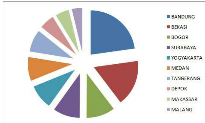
Figure 3. Data Spatial for each City in Indonesia

With regard to managing relationships with the public, social network has become a crucial medium in political campaigns [9]. Indeed, social networks provides a powerful channel through which candidates can develop and enhance interactions and relationships with potential voters [9-10]. Using social networks is common in Indonesia, which as noted earlier, is the fourth-largest user of Twitter worldwide. Figure 3 shows spread of Twitter’ users for the topic of “Jokowi”, “Prabowo”, hashtag “#2019gantipresiden” (2019 change president), and hashtag “#2019prabowopresiden” (2019 Prabowo president). It shows that majority of the tweet came from major big cities in Indonesia.