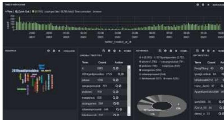
Figure 2. Systems Interface

The competition’s nature in politic is similar with the business competition. Both share a basic social media’s strategies such as attract new customers, retain them in the business, and make them a loyal customer [8]. Social networks change the nature of political parties from one-to-one interaction to multi channels interactions.